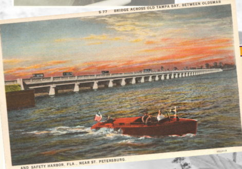
677 BRIDGE ACROSS OLD TAMPA BAY, BETWEEN OLDSMAR AND SAFETY HARBOR, FLA., NEAR ST. PETERSBURG