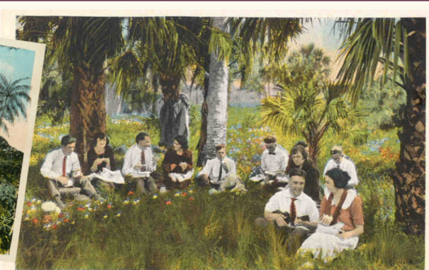
MIDWINTER PICNICING AT OLDSMAR, FLORIDA.