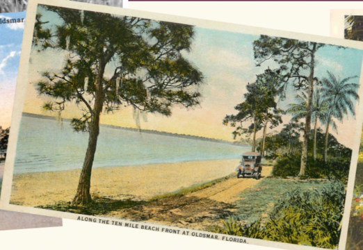
ALONG THE TEN MILE BEACH FRONT AT OLDSMAR, FLORIDA.