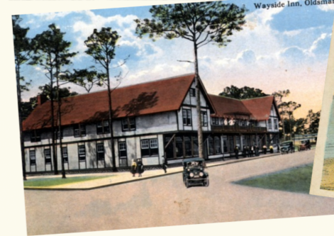
Wayside Inn, Oldsmar