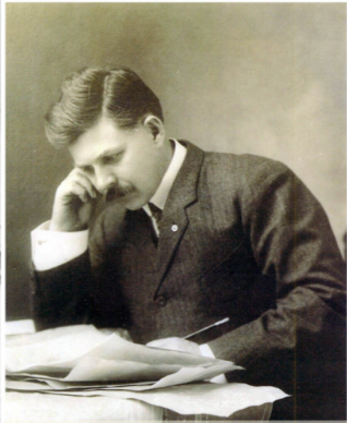
RANSOM E. OLDS